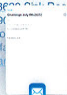
Challenge July 9th 2022

PO Box 180 • 58620 Siskiyew Dowagiac, MI 49829 (269) 782-1763 o (269) 782-1964 f www.Pokagonband.org