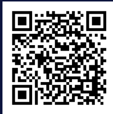
Michigan DNR Invasives