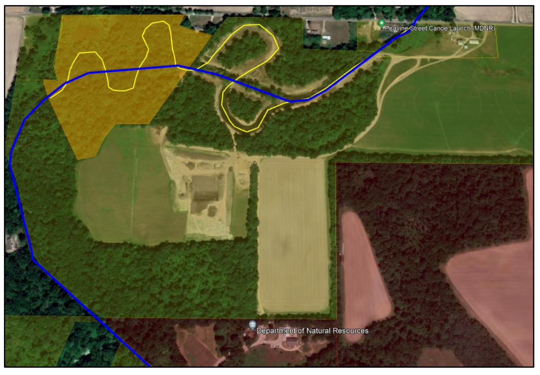
Figure 1. Hunting and gathering closure area where the Dowagiac River Re-Meander project Phase 2 restoration continues during 2023 and 2024. The closure area is 29 acres.